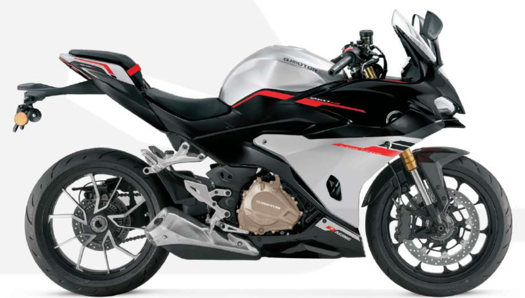
DAY & NIGHT BLACK