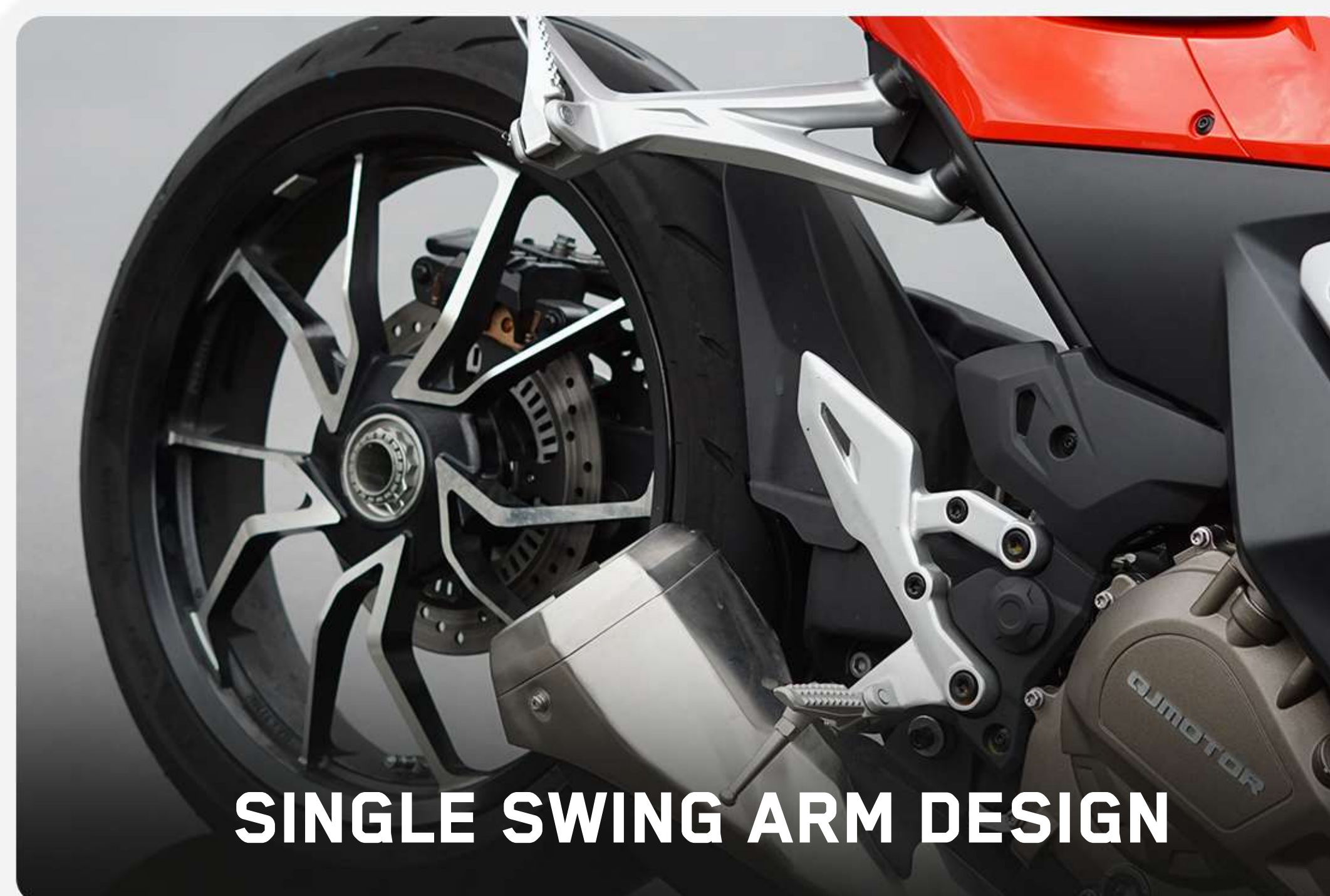
SINGLE SWING ARM DESIGN