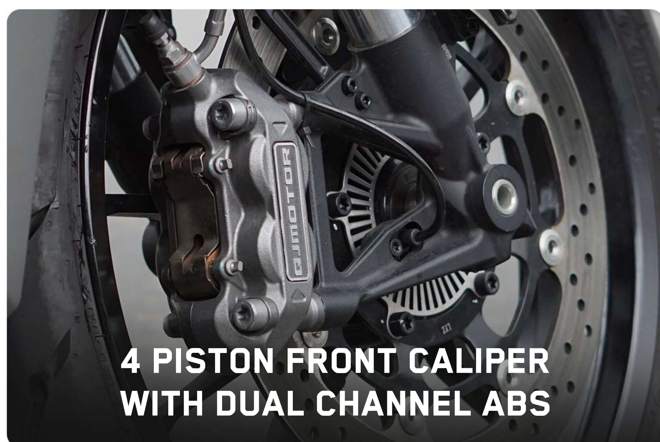
4 PISTON FRONT CALIPER WITH DUAL CHANNEL ABS