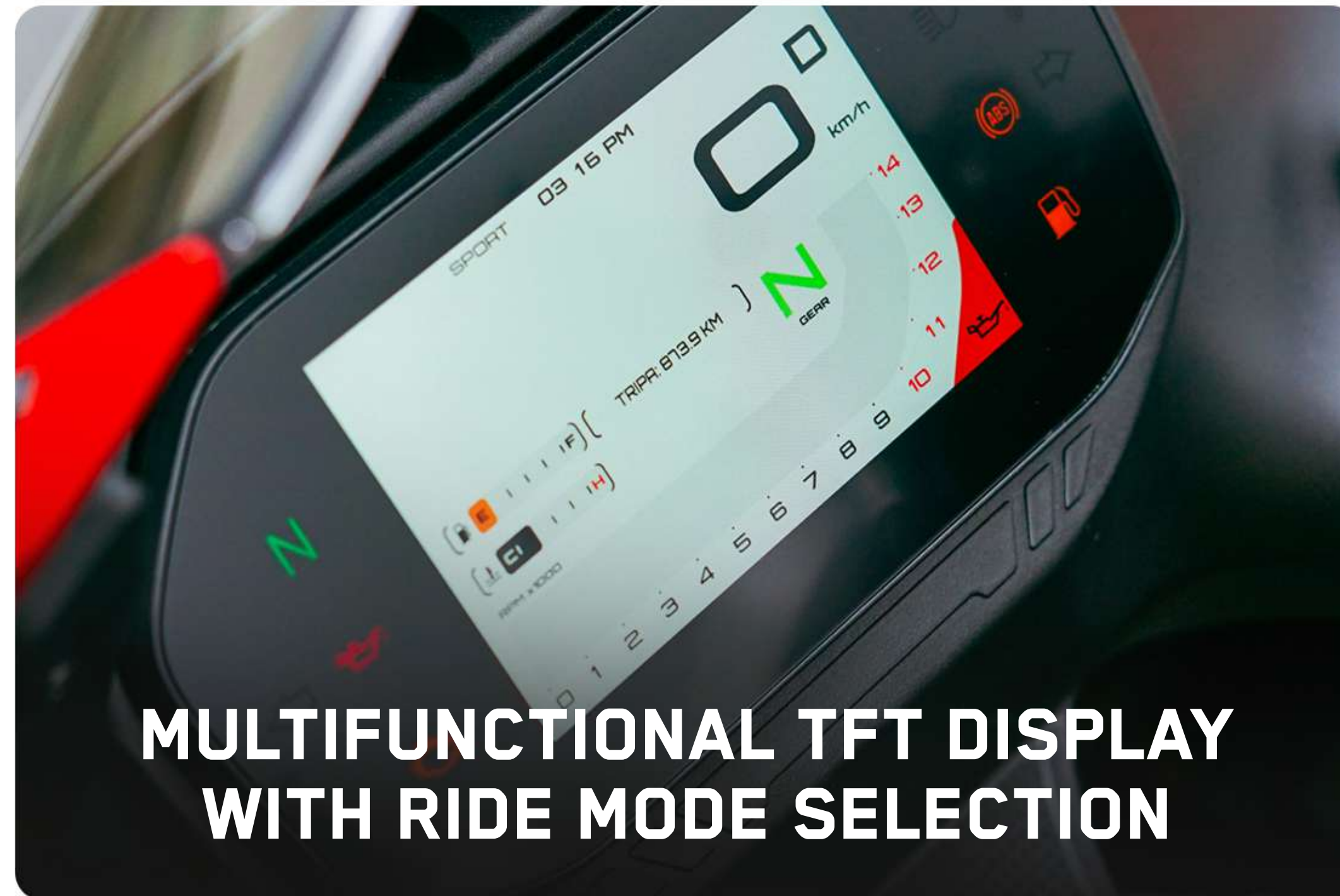
MULTIFUNCTIONAL TFT DISPLAY WITH RIDE MODE SELECTION